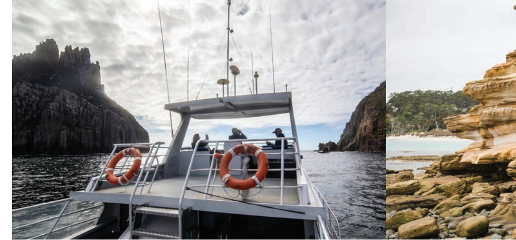
CLOCKWISE FROM LEFT: The Candlestick , Cape Hauy , on the Tasman Peninsula ; Skirt around the sheer sea cliffs of Cape Pillar and Tasman Island onboard Odalisque ; See the swirling patterns of the Painted Cliffs, Maria Island ; Wineglass Bay is one of East Coast Tasmania's celebrated beauty spots.

SPINDLY COLUMNS OF DOLERITE TOWER hundreds of metres above me, the dark-grey igneous cliffs slicked with a fine mist of sea spray. To my left a pod of whales breaks the surface, one by one, plumes of air spouting from their blowholes and mixing with the sea haze as shearwaters wheel and dart above the waves. Looking ahead, I see a small gap in the wall of rock where the water is churned into a maelstrom by powerful swells that detonate with a boom at the base of the cliffs on either side.