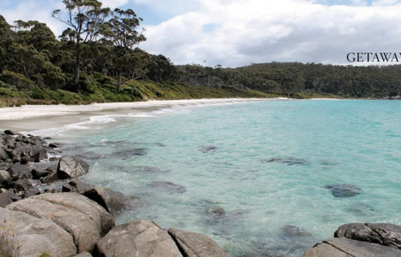
GETAWAYS | East Coast Tasmania